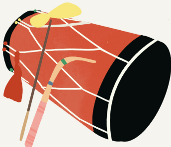
3. Dhol (Say: Dole)

A pair of twin hand drums from North India. It is used a lot in Hindustani Music.