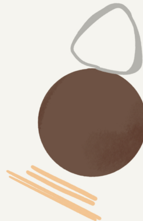
4. Parai (Say: Pa-wry)

A drum that is used to accompany Punjabi folk music. You might hear it during a Bhangra performance.