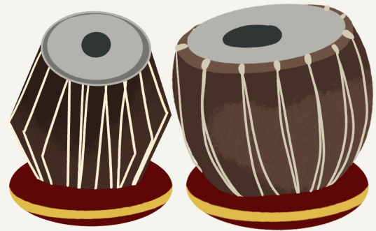
2. Tabla (Say: Ta-blaa)

A drum from Tamil Nadu, an area in South India. This drum can be found in Carnatic music, a style of Indian music. Many Indians in Singapore have roots in South India.