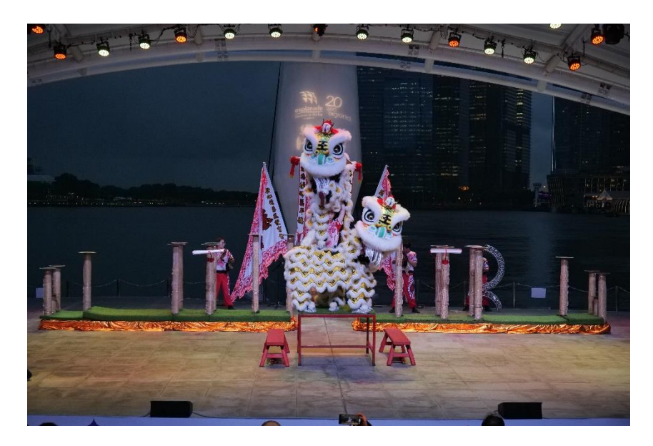
Huayi – Chinese Festival of Arts 2024 kicks off with a breathtaking lion dance performance on high poles by the award-winning Yi Wei Athletic Association!

by Yi Wei Athletic Association (Singapore)