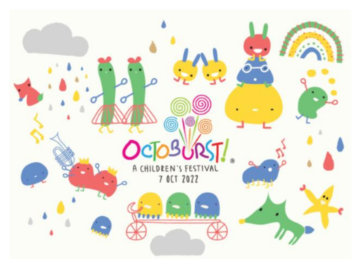
About Octoburst! - A Children's Festival

In conjunction with Children's Day in October, Esplanade presents Octoburst! – a festival that encourages artful play and fun for all.